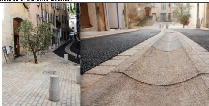
Illustration of the product:

Setts, cobblestone, slabs and kerbs for external paving and edging, in natural limestone, including the following references: beige pacífico, pérola and sonato; semi-rijo salgueira; estremadura creme, azul and amazona; azul primavera, creme champanhe, vale amazona and lioz; Beige classico, azul clássico, amazona clássico and branco clássico.